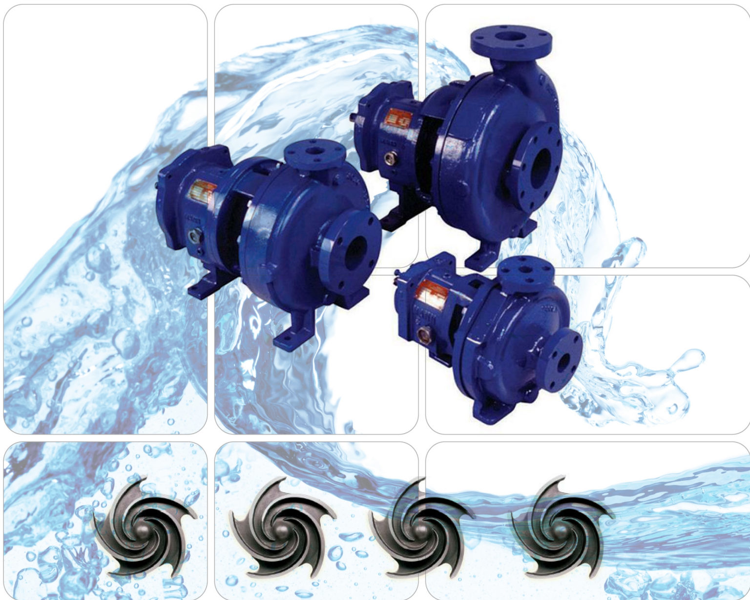
Process pump UA 3196 series