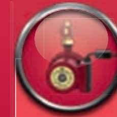
UPA ► Domestic booster

TECHNICAL DATA ► Max. head: 1,2 m ► Max. flow: 0,6 m 3 /h