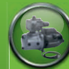
JP BASIC PC ► Self priming pump

TECHNICAL DATA ► Max. head: 9 m ► Max. flow: 14 m 3 /h