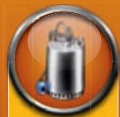
UNILIFT AP12 ► Submersible drainage pumps

TECHNICAL DATA ► Potential inlets: WC (DN 100) + 3 (DN 40) ► Max. liquid temp.: 40°C