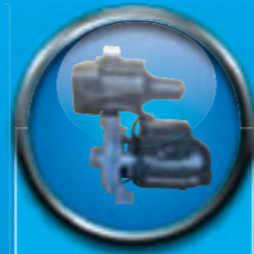
NS BASIC PC ► Centrifugal pump

TECHNICAL DATA ► Max. head: 50 m ► Max. flow: 12 m 3 /h