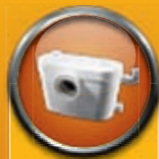
SOLOLIFT+ WC RANGE ► Lifting stations with grinder

TECHNICAL DATA ► Max. head: 18 m ► Max. flow: 30 m 3 /h