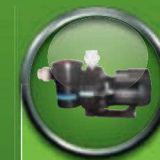
SB ► Self priming pump

TECHNICAL DATA ► Max. head: 45 m ► Max. flow: 3,5 m 3 /h