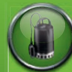
UNILIFT CC ► Submersible drainage pumps

TECHNICAL DATA ► Max. head: 55 m ► Max. flow: 4 m 3 /h