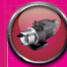
MQ ► Multistage pressure system

TECHNICAL DATA ► Max. head: 50 m ► Max. flow: 3,5 m 3 /h