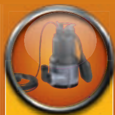
KP BASIC ► Submersible pump

TECHNICAL DATA ► Max. head: 17 m ► Max. flow: 35 m 3 /h