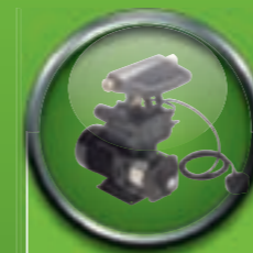
CH-PC WITH PUMP GENIE ► Pressure system with interconnect device

TECHNICAL DATA ► Max. head: 55 m ► Max. flow: 4 m 3 /h