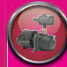
JP RAIN PC ► Self priming pump

TECHNICAL DATA ► Max. head: 50 m ► Max. flow: 3,5 m 3 /h