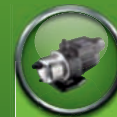
MQ ► Multistage pressure system

TECHNICAL DATA ► Max. head: 48 m ► Max. flow: 5 m 3 /h