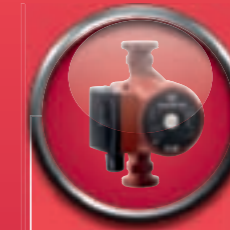
UPS ► Domestic circulator – hot water and heating

TECHNICAL DATA ► Max. head: 10 m ► Max. flow: 12 m 3 /h