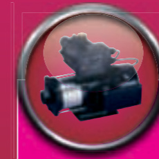
CH-PC ► Pressure systems

TECHNICAL DATA ► Max. head: 45 m ► Max. flow: 3,5 m 3 /h