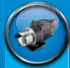
MQ ► Multistage pressure system

TECHNICAL DATA ► Max. head: 30 m ► Max. flow: 7 m 3 /h