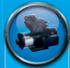
CH-PC ► Pressure systems

TECHNICAL DATA ► Max. head: 55 m ► Max. flow: 8 m 3 /h