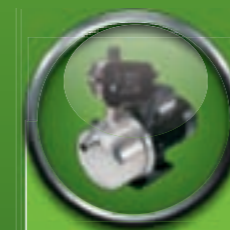
JP PC ► Stainless steel self priming pump

TECHNICAL DATA ► Max. head: 18 m ► Max. flow: 30 m 3 /h