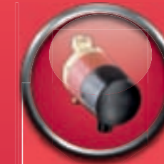
COMFORT ► Domestic circulator – hot water

TECHNICAL DATA ► Max. head: 10 m ► Max. flow: 12 m 3 /h