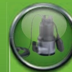
KP BASIC ► Submersible pump

TECHNICAL DATA ► Max. head: 50 m ► Max. flow: 4 m 3 /h