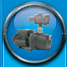
JP RAIN PC ► Self priming pump

TECHNICAL DATA ► Max. head: 45 m ► Max. flow: 3,5 m 3 /h