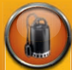
UNILIFT CC ► Submersible drainage pumps

TECHNICAL DATA ► Max. head: 9 m ► Max. flow: 14 m 3 /h