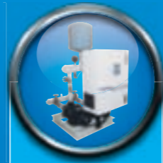
COMPACT E ► Pressure booster pump

TECHNICAL DATA ► Max. head: 50 m ► Max. flow: 7,5 m 3 /h