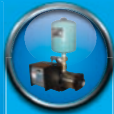
UNI E ► Variable speed booster system

TECHNICAL DATA ► Max. head: 55 m ► Max. flow: 8 m 3 /h