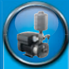
CME BOOSTER ► Pressure systems

TECHNICAL DATA ► Max. head: 50 m ► Max. flow: 3,5 m 3 /h