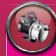
JP PC ► Stainless steel self priming pump

TECHNICAL DATA ► Max. head: 55 m ► Max. flow: 8 m 3 /h