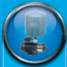
CH-PT ► Pressure systems

TECHNICAL DATA ► Max. head: 55 m ► Max. flow: 8 m 3 /h