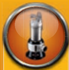
UNILIFT AP 35B/50B ► Submersible Effluent pumps

TECHNICAL DATA ► Max. head: 9 m ► Max. flow: 14 m 3 /h