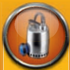
UNILIFT KP ► Submersible drainage pumps

TECHNICAL DATA ► Max. head: 9 m ► Max. flow: 14 m 3 /h